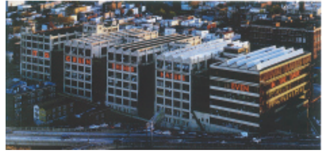
Mary Ellen Carroll's text piece indestructible language in Jersey City, N.J.

An environmentally minded public artwork by Mary Ellen Carroll is currently on view in Jersey City, N.J., through Apr. 7. Called indestructible language , it consists of a rather oblique text—"It is green thinks nature even in the dark"—spelled out in 8-foot-tall neon letters spread across the windows and wrapping around a